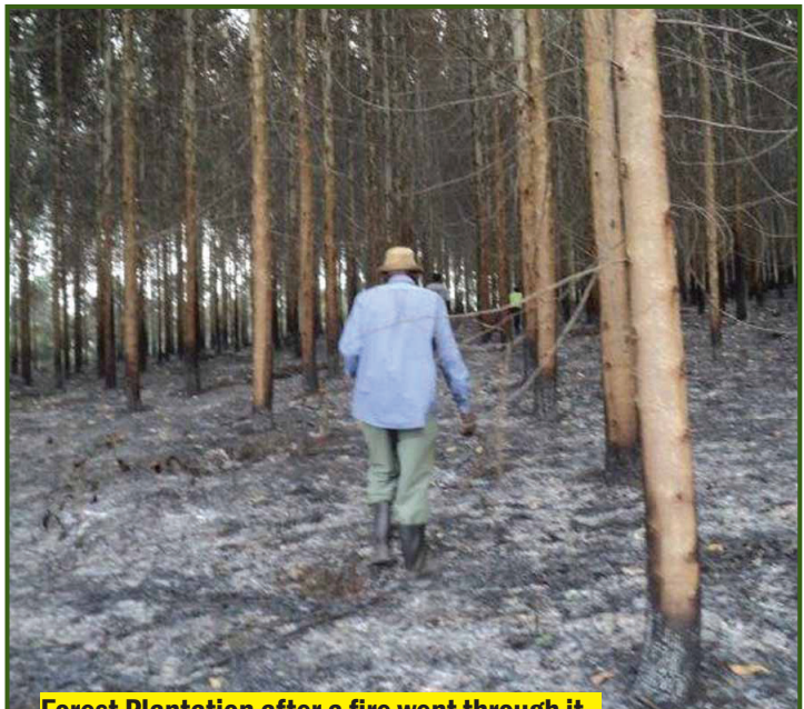
Forest Plantation after a fire went through it