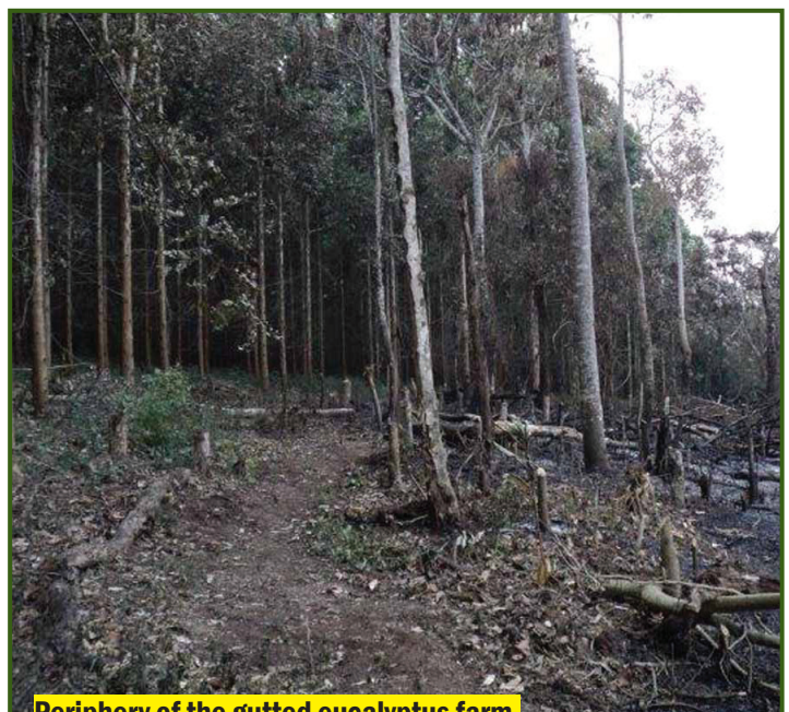
Periphery of the gutted eucalyptus farm