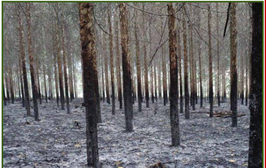
A UTGA grower lost part of his eucalyptus plantation to an accidental fire recently

Uncontrolled fires are a major problem because they pose a risk to life, property, and the environment. The expansion of human settlements across the countryside, into areas bordering fire-adapted lands and fire-vulnerable commercial agriculture, has put people increasingly at risk from wild fires. Over millions of years ago, early human beings used fire to hunt and manage their environment.