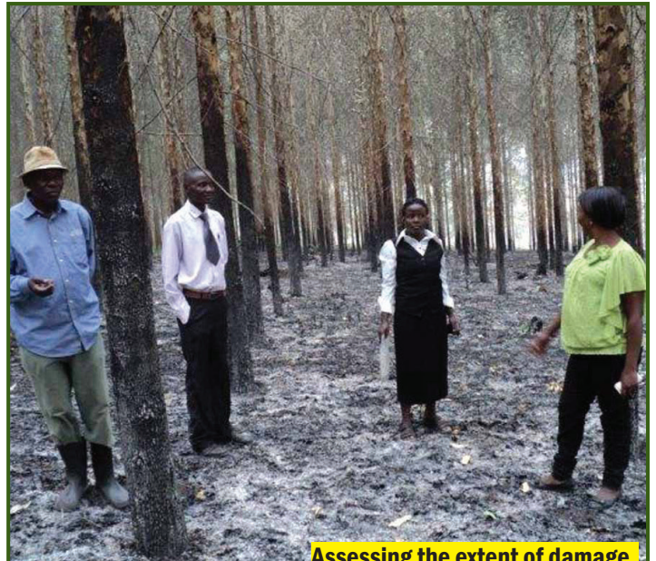
Assessing the extent of damage